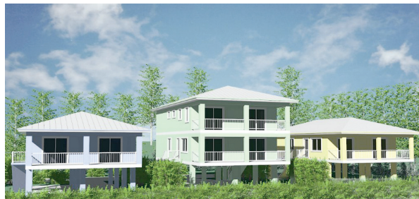
Future Habitat homes at "Esslinger Corner"

HFHUK has another eight lots in inventory. Called the Esslinger Corner Project, ground breaking is planned on three of those lots in Islamorada.