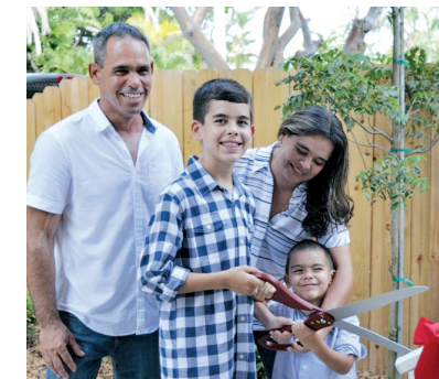
Mandalay homes ribbon cuttings