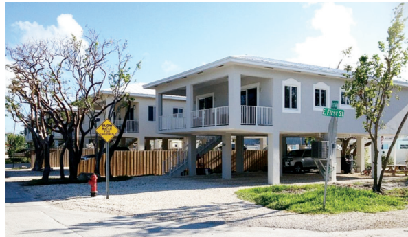
Completed 7 Mandalay homes

In 2017, HFHUK embarked on a campaign to BUILD 50 . Since our inception, 33 houses have been built and purchased by local families as their first homes. These homes are built on the Habitat principles of simple, decent, and affordable, and we are pleased to report the houses we built survived Hurricane Irma with no damage to their structures. We are proudest of our Mandalay project, completed in 2017 in Key Largo, where seven homes were built.