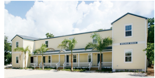
Completed Holtzman homes